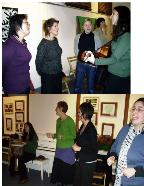
Figures 3 and 4. The music specialist conducting singing practices

illustrated how some educators' practices had changed because of the singing group.