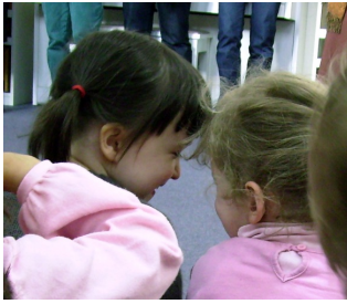
Figures 1 and 2. Some teachers in the singing group performing. Two children listening to their teachers.