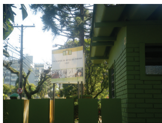
Faculdade de Artes do Paraná (FAP), site for the 2014 Commission for Music in Special Education, Music Therapy, and Music Medicine symposium in Porto Alegre, Brazil

Curitiba is the capital and largest city of the Brazilian state of Paraná with close to two millions inhabitants. Curitiba is a cultural, political, and economic center in the country and in Latin America. In 2010 Curitiba was awarded the Globe Sustainable City Award, given to cities and municipalities which excel in sustainable urban development around the world.