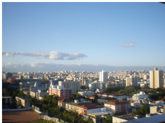
Porto Alegre, City View, site of the 2014 ISME World Conference

Porto Alegre, the host city of ISME 2014 is the capital of Rio Grande do Sul, a State located in the extreme south of the country. As an important commercial and economic centre, Porto Alegre is proud to be one of the best Brazilian cities in terms of quality of life, characterized by its intense cultural life and by its respectful relation with nature. It is considered a city with a high standard of living and one of the most prepared to receive investments. Porto Alegre is home to many government-funded and private universities and to two higher education music courses. In addition, music education is present in the curricula of many private and government-funded schools.