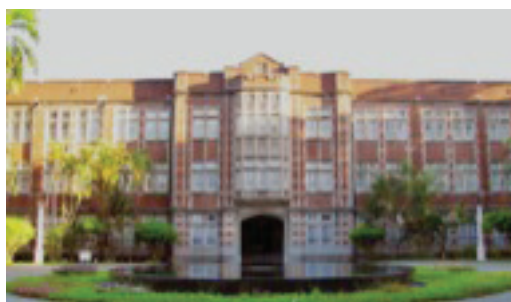
Music Building, National Taiwan Normal University